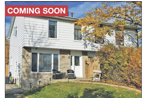
Beautifully Finished Semi with Fabulous Yard $610,000.