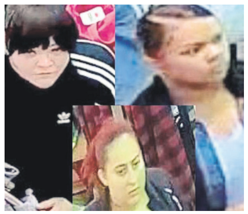
These three women are accused of stealing clothes from Toronto Premium Outlets in Halton Hills.