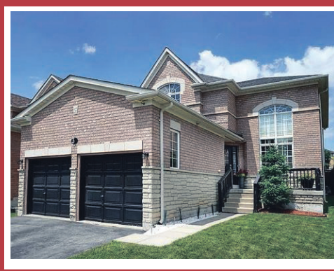
CALL TODAY FOR MORE INFO!