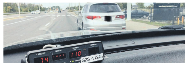
Halton police charged the driver of this vehicle Wednesday, Sept. 25 after it was clocked going 50 km/h over the speed limit in Halton Hills on Steeles Avenue.