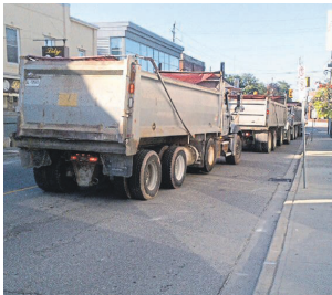
Truck traffic in a busy Norval intersection has been a major cause for concern for residents. Above, heavy trucks make their way through downtown Acton.