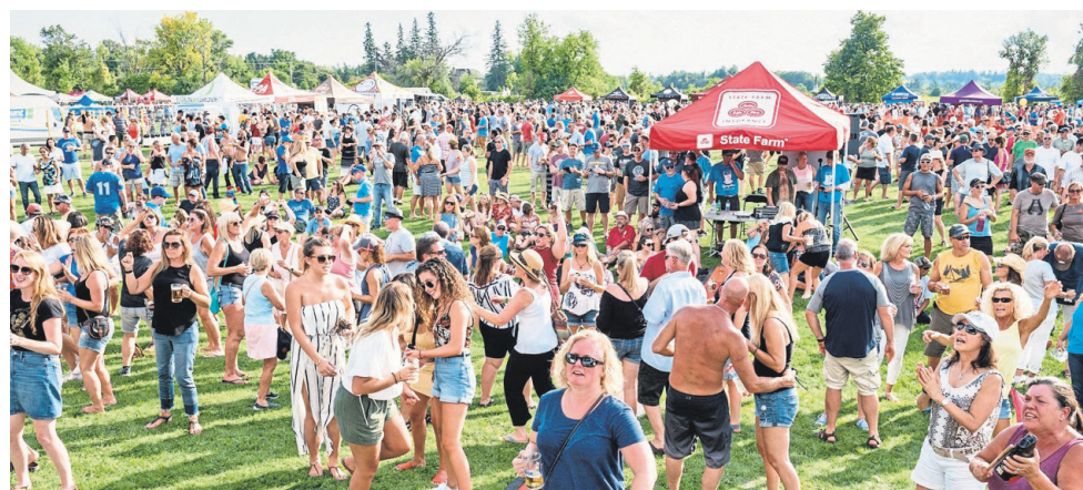
Head for the Hills Photo

"It's amazing to work with these people," Fini said. "If it weren't for them, this festival would have