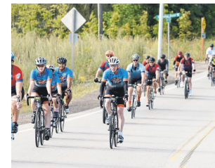
Hundreds of riders took to the roads around Halton for the Epic Bike Tour Halton.

The hills might be the hard part, but Tour The Hills is a chance to get a ride in on the last weekend of the summer season.