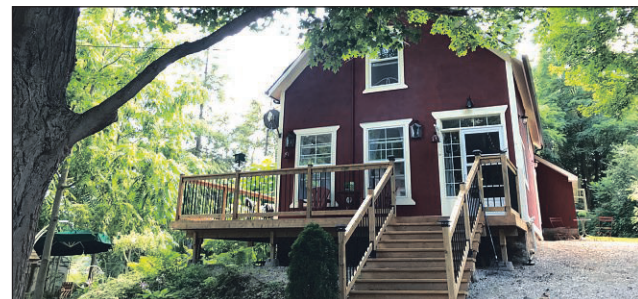
Country Close to Town - Updated Century Charmer $850,000