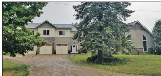
Renovated 4 Bed + 3 Bath - 1 Acre $1,049,000