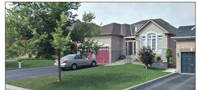
Fabulous Bungalow on Quiet Street - $849,000