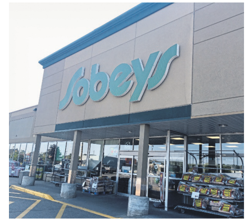
Acton Sobeys' low-sensory shopping experience will run every Wednesday from 6 to 8 p.m.