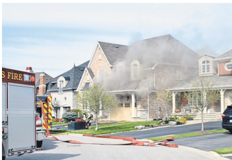
Halton Hills Fire attended a home after reports of smoke from the residence following a power surge on May 16.

Halton Hills Hydro confirmed the power outage affected nearly 4,000 customers in Halton Hills caused by a pole fire. Several residents reported popping noises, sparking, or smoke from outlets. Halton Hills Hydro advised residents who think