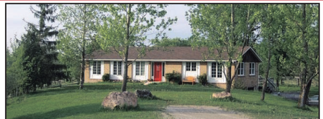
29+ ACRES - BUNGALOW - BARN $1,075,000