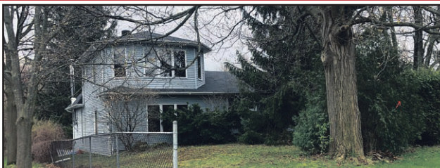
4 BEDROOM BUNGALOF - 1/2 ACRE AT THE EDGE OF TOWN $822,000

COMING SOON TO THE MLS SYSTEM - CALL BETTY FOR DETAILS