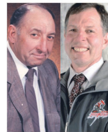
Sunny Acre Farms - Bianchi Family - Builder - Hockey