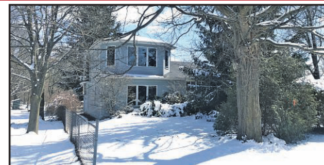
4 BEDROOM BUNGALOW - 1/2 ACRE AT THE EDGE OF TOWN $822,000