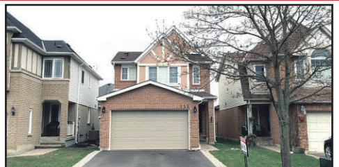
3 BEDROOM - GEORGETOWN SOUTH - FINISHED BASEMENT $699,900