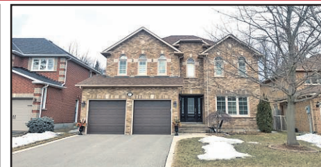
GEORGETOWN SOUTH RAVINE - MAIN FLOOR OFFICE - FINISHED BASEMENT $1,200,000