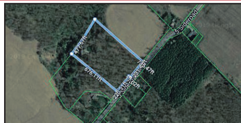
CUSTOM HOME - WORKSHOP - POOL - ~7 1/2 ACRES $1,600,000