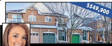
Samantha Hudyma Sales Representative

Freehold townhouse in prime location! Walking distance to all amenities. Brand new S/S appliances (2018), new washer, dryer & water softener (2017), shingles (2017). Double front doors, open concept main level w/ hardwood floors, gas fireplace, floor-to-ceiling mirrored wall. Upper level w/ 3 bedrooms and balcony. Call for more details!