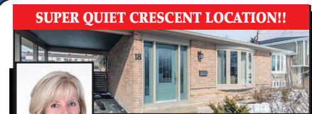
Cathy Graham-Smith Sales Representative

22 Arborgen Drive Stunning! Rare 5 bdrm on picturesque ravine lot in prestigious Arborgen Estates. Over 3500 sqft - Call for all the details!