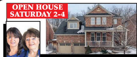
Moira Robinson and Therese Conlon Sales Representative

This home is truly move-in ready! Updated hardwood floors, dynamite kitchen, stunning new main bath. Lovely front patio, private rear patio and gardens, fully fenced yard. Updated shingles, windows, furnace and C.A.C. Finished basement w/ 3 pc bath. Oversized garage plus driveway parking for multiple vehicles. Call me for more details!