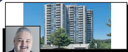
Mitch Lajeneusse Sales Representative

Freehold townhouse in prime location! Walking distance to all amenities. Brand new S/S appliances (2018), new washer, dryer & water softener (2017), shingles (2017). Double front doors, open concept main level w/ hardwood floors, gas fireplace, floor-to-ceiling mirrored wall. Upper level w/ 3 bedrooms and balcony. Call for more details!