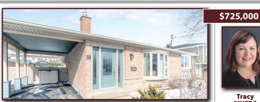
18 Marilyn Crescent, Georgetown