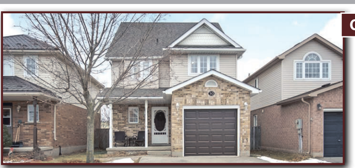
30 Beardmore Crescent, Acton