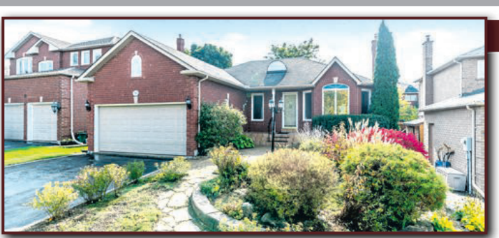
19 Gollop Crescent, Georgetown OPEN HOUSE Saturday and Sunday 2-4 PM

Desirable 3 Bedroom, 3 Bathroom Bungalow On Fabulous, Quiet, Sought-After Crescent In Georgetown South Living Space Includes Bright & Open Living Room With Gas Fireplace And Dining Room, Along With An Updated Kitchen\,With\,Quartz\,Counters, Custom\,Backsplash, Lots\,Of\,Cupboard\,\&\,Counter\,Space\,\&\,A\,Walkout\,To\,The\,Deck\,AMB (Market Counter) In A Nice Private Yard. Master Bedroom With Walk-In And Ensuite. Spacious Finished Basement Features Large Rec Room With Kitchenette, A Hobby Room & A Three-Piece Bathroom. A Rare Find In Georgetown South!