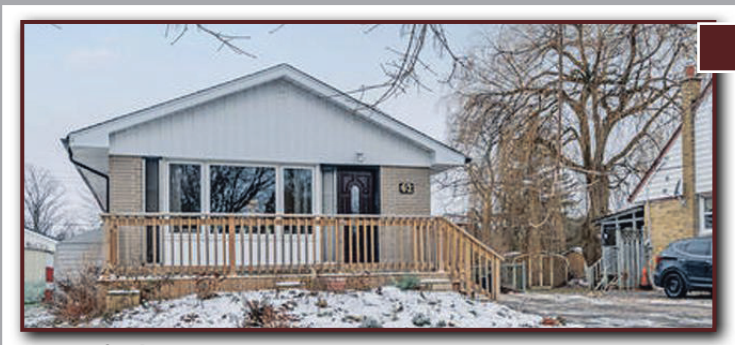
62 Roseford Terrace, Acton