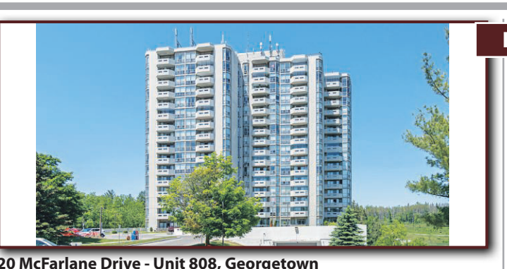
20 McFarlane Drive - Unit 808, Georgetown

Bright & spacious 2 Bedroom 2 Bathroom Condo in "The Sands". This 1,236 sq ft unit has been impeccably maintained with open concept living/dining room, solarium & private balcony with beautiful views! Eat-in kitchen with tons of cupboards & overlooking dining room.\ Master\ suite\ offers\ walk-in\ closet\ \&\ 4-pc\ ensuite!\ Large\ second\ bedroom,\ additional 3-pc bath, & laundry complete this perfectly laid out condo!