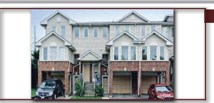
82 Stewart MacLaren Road, Georgetown OPEN HOUSE Saturday and Sunday 2-4 PM

3 bedroom, 3 bathroom stacked condo / townhouse. Updated kitchen with custom backsplash. Open concept living / dining with walk-out to private patio. Master bedroom with walk-in closet and 3-piece ensuite.