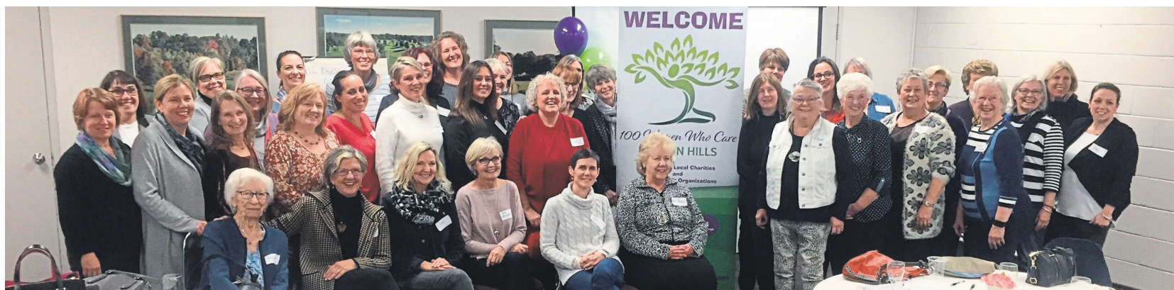
100 Women Who Care Halton Hills held its inaugural meeting on Nov. 14.

Of the three nominations presented at the Nov. 14 meeting, the charity chosen to receive their very first donation was The Georgetown Bread Basket. Prior to the vote, founding co-ordi-