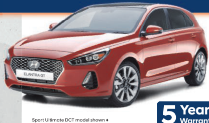
Sport Ultimate DCT model shown