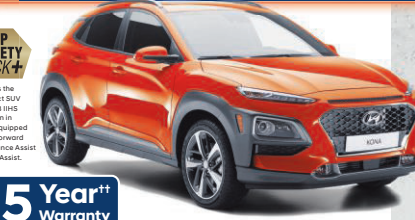
Ultimate model shown