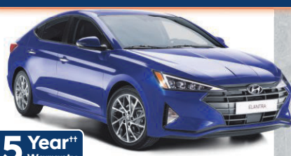
Ultimate model shown