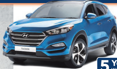
Ultimate model shown