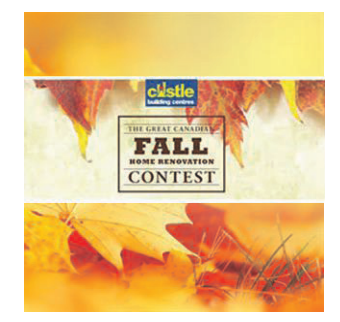
DROP IN THE STORE TO ENTER

Maximum durability and reduced blade breakage. Wide blade and