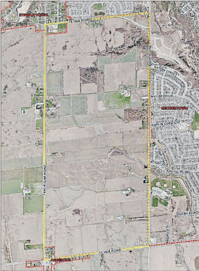
Town of Halton Hills

A map of the proposed 1,000 acres area to be developed into housing, parks, schools and other services in order to accommodate provincially mandated growth.