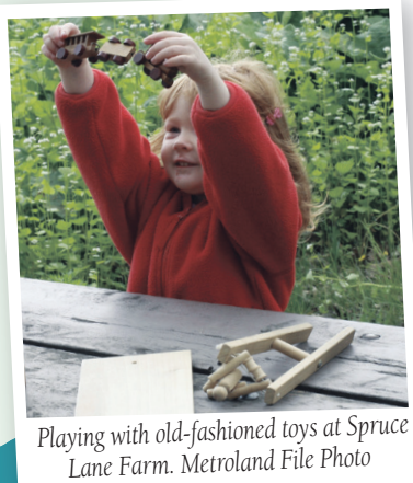
Playing with old-fashioned toys at Spruce Lane Farm.

Experiencing history in action at a historic site, be it a military fort, a recreated historic village or cultural institution, is a great way to learn about the roots of our nation as well as First Nations. Take time this summer to visit some of the many living history attractions in Southern Ontario and beyond. Here's a sample of what's available to explore.