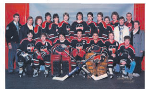
Georgetown Juvenile Gemini AA Hockey Team 1987-88