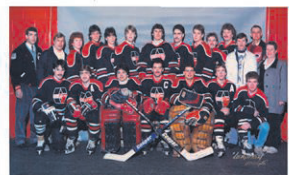
Georgetown Juvenile Gemini AA Hockey Team 1987-88