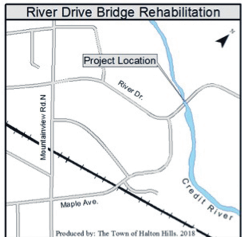
Produced by: The Town of Halton Hills, 2018