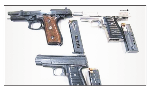
IFP fille photo

Gun owners in Halton can call the OPP non-emergency number (1-888-310-1122) to arrange for officers to retrieve the weapons, or Halton police at 905-634-1831.