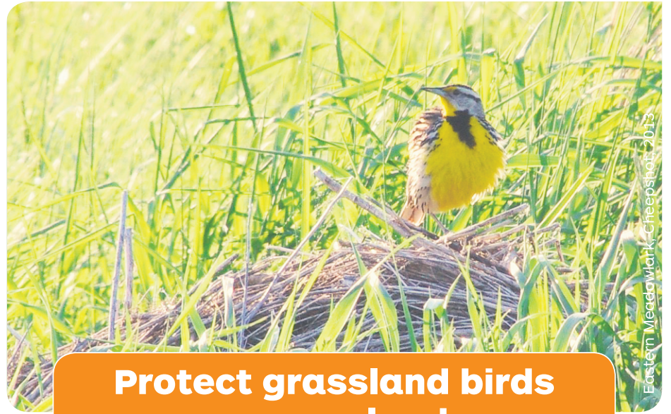
Eastern Meadowlark, Cheepshot, 2015