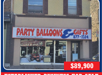
ESTABLISHED BUSINESS FOR SALE

RURAL APARTMENT FOR LEASE 800 SQ. FT. BEAUTIFUL RURAL LOFT APARTMENT VERY CLOSE TO ACTON ON 30 ACRE PROPERTY. $1400 ALL INCLUSIVE. AVAILABLE