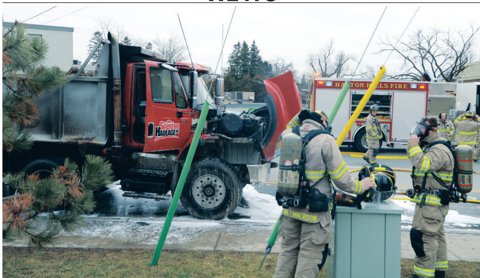
Members of the Halton Hills Fire Department responded to a dump truck fire late Tuesday morning on Maple Ave. in front of the Canada Post building on Maple Ave. The fire was quickly put out.