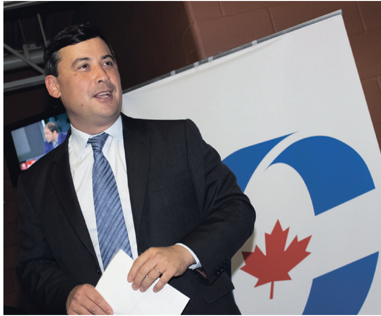
Wellington-Halton Hills MP Michael Chong won a sizeable victory in the fall federal election. Chong said many of his constituents are urging him to seek the party leadership.

Canadians have just elected a new government, lead by a new generation, Chong indicated. The Canadian public has signaled that a new era in Canadian politics has been ushered in. Chong sees himself as fitting into that new dynamic.