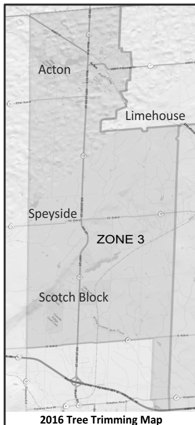
2016 Tree Trimming Map