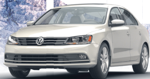
Highline model shown