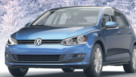
Highline model shown