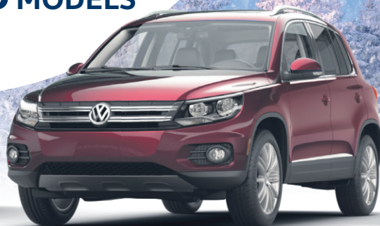
Highline model shown