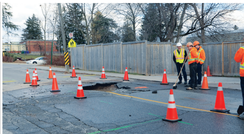
As if the traffic tie-ups hadn't already made getting through Acton on Thursday like finding the end of a maze, a broken watermain closed off streets around the Halton Hills Public Library for a couple of hours in the early afternoon.