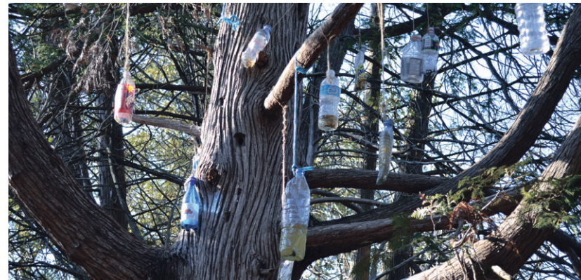
TRASHING HUNGRY HOLLOW: Structures, much like the top photo, have been showing up off the main trails in Hungry Hollow. When abandoned, garbage is left behind on the ground, in the ravine and in the trees, as seen in the bottom photo.