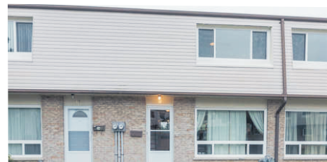
Sold by HeyRay.ca

Take Me I'm Yours!! Lovingly updated & cared for 4 bedroom home in a great central location. Main level offers hardwood flooring in living & dining room, walkout to private mature fenced lot with patio & above ground pool! $489,900.00 Georgetown MLS#W3328083