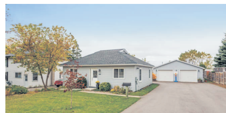
Sold by HeyRay.ca

Kick The Habit! Of paying rent when you buy this lovingly cared for & tastefully decorated 3 bdrm townhouse. Perfect for a young family or executive couple. Great lay-out with durable laminate on all 3 levels! $299,900.00 Mississauga MLS#W3348942