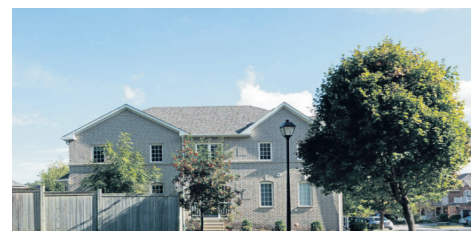
Sold by HeyRay.ca

Almost New Again! Thousands spent updating this sweet bungalow nestled on a large mature 66' x 132' ft. lot with no neighbours behind! Perfect for those starting out or empty nesters. Bonus 28' x 30' ft. heated man cave! $369,900.00 Rockwood MLS#X3339935