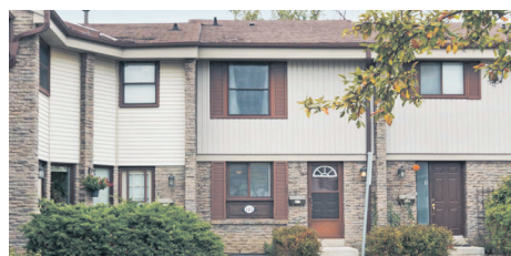
Sold by HeyRay.ca

Let The Sun Shine In!! Move right into this bright 3 bdrm, 1.5 bath townhome! Easy to clean laminate flooring in the kitchen & dining room. Walk-out to deck & fenced yard. Walking distance to Georgetown Market Place & parks. $259,900.00 Georgetown MLS#W3337063