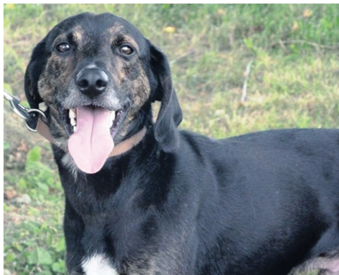
NORM IS PERFECT FOR AN EXERCISER

It should be noted that Norm, though a mix, shows many Catahoula traits. Catahoula dogs are highly intelligent and energetic; usually even-tempered and although happy with a job, make good family dogs as long as they are not isolated; inter-