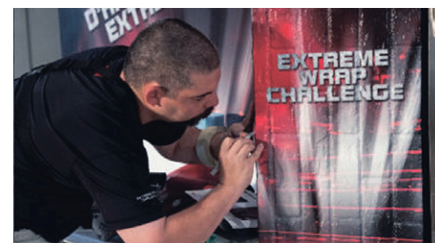
Bieber working on Extreme Challenge #1: Texture.

The competition was intense. Bieber competed against two very strong contenders in three challenges featuring extreme texture, extreme stretch and extreme temperatures. Each challenge featured a different prop including a bar fridge, a goalie mask and a free-standing wall, which was wrapped in intense heat. The contenders