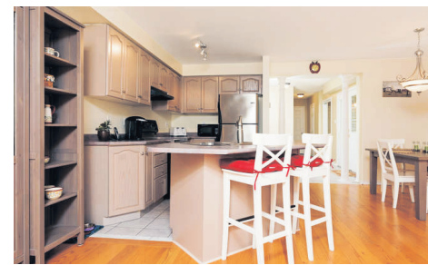
Once You Come In! You won't want to leave this spacious 3 bdrm, 2.5 bath, end unit town house situated on a huge corner lot (one of the biggest in the development). Open concept layout, sun-filled kitchen with island & breakfast bar open to living/dining room combo. Gleaming hardwood & ceramic on main level! Finished lower level. Fully fenced yard with deck, above ground pool & plenty of extra room! Fabulous location, close to shops, splash pad, parks, schools & GO. $474,900.00 Georgetown MLS# W3320830