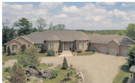
Hold Your Horses! Stunning custom built 4,500 sq.ft. executive bungalow nestled on 45 acres - ideal for an equestrian or hobby farm w/2 ponds. Privacy of country living - Georgetown, Acton & highways a short drive away! $1,499,000.00 Halton Boundary MLS# X3303328