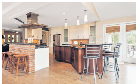
It's Hard To Be Humble! When you own this sprawling almost 1800 sq.ft., 2+2 bedroom bungalow on a gorgeous 2.5 acre lot! Decorated with a designers flair from top to bottom with gourmet kitchen, sun-filled open concept living & dining rooms, hardwood, tray ceilings, pot lights, spa-like master ensuite & more - perfect for entertaining! Lower level offers a rec room with gas stove, sitting room, 2 additional bedrooms, cantina with walk-up to 3 car garage. Simply perfect! $899,900.00 Acton MLS# W3327133