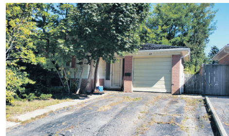
If I Had A Hammer!!! A ton of nails, gallons of paint, shingles & tons of elbow grease, I might be able to fix this 3 bdrm raised bungalow with garage to the perfect family home. Good sized fenced lot, great location to schools! $334,900.00 Georgetown MLS# W3323140