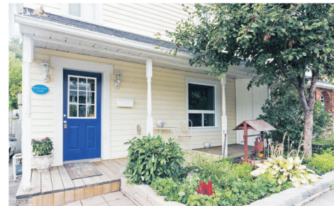
Yes You Can!!! Stop paying rent when you can buy this updated 1,156 sq.ft. 3 bdrm, 1.5 bath, semi-detached home on a beautiful mature lot! Great location close to "GO", shops, schools & more! Just move in. $299,900.00 Acton MLS# W3293019