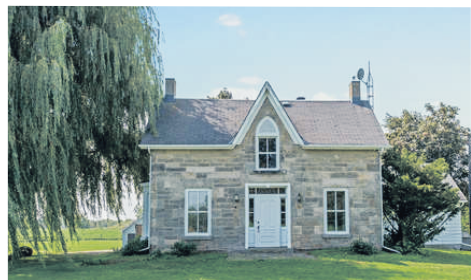
A Horse Of Course should go in the 5 stall barn that comes with this picturesque ~53 acre property complete with charming century stone home with hugs addition offering approx 3,039 sq.ft. of above grade living space! Located on a paved road with large barn, suitable for horses, drive shed/office, silo, 4 car detached garage & approx 35-40 acres of workable land! Lots of original charm & character yet updated. Great location, only minutes to Georgetown, Acton & Erin. $1,249,900.00 Rural Halton MLS# W3327742