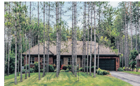
Made In The Shade of Giant Pines in the beautiful & exclusive Pine Ridge Estates! This stunning 2,800 sq.ft., 3+2 bdrm, 5 bath, custom bungalow is nestled on just 1 acre. Renovated with all the bells & whistles. Stunning! $874,900.00 Erin MLS# X3294672