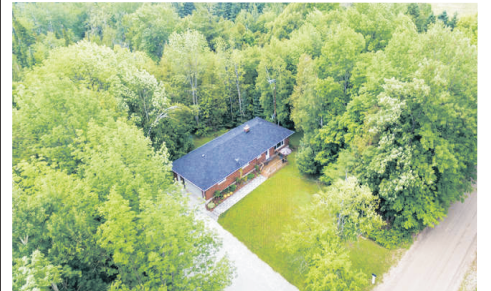
Country Roads Take Me Home! Gorgeous park-like lot (1+ acre) and mature trees are the backdrop for this lovely renovated 3+1 bdrm bungalow with W/O from finished lower level. Rec Rm with laminate, fireplace & pot lights. $549,900.00 Erin MLS# X3245520