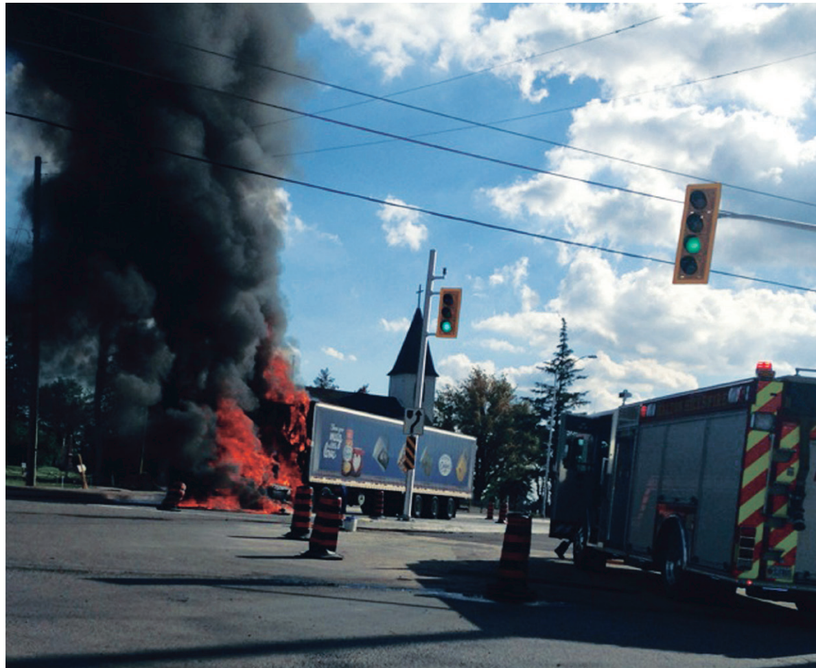
A bystander took this photo of a tractor trailer not long after it caught fire at Steeles Ave. and Ninth Line late Tuesday afternoon, forcing roads in the area to be closed for several hours. Submitted photo