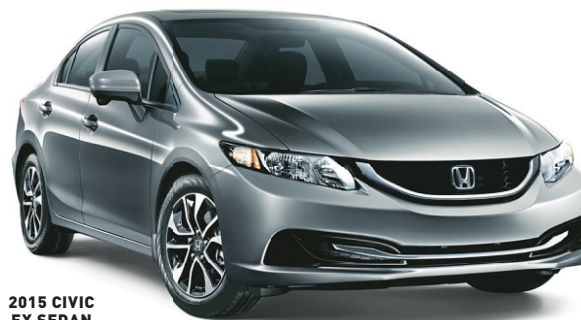
2015 CIVIC EX SEDAN

LEASE FOR 60 MONTHS 2 OR FINANCE FOR UP TO 84 MONTHS 3 ON 2015 CIVIC SI SEDAN