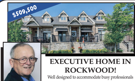
or a senior lifestyle. Thousands spent upgrading this

home including Central Vac, Under Counter Lighting Skylight in the loft, Water softener, hardwood flooring and Gas Fireplace in the living room