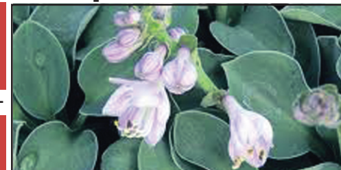
*Sale ends Aug. 24th. While quantities last.