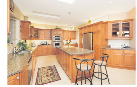
Hold Your Horses! Stunning custom built 4,500 sg.ft. executive bungalow nestled on 45 acres - ideal for an equestrian or hobby farm w/2 ponds. This spacious & gracious home offers quality features throughout - imported porcelain tile, hrdwd, pot lights, 2-sided fp & Kitchen with all the bells & whistles! Massive Rec rm w/2 bdrm, 3 pc bath, tons of storage & W/O to patio. Enjoy the privacy of country living with Georgetown, Acton & 401/407 highways just a short drive away! $1,549,000.00 Halton & Erin Boundary MLS#X3125808