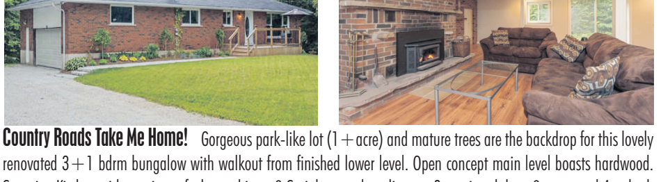
renovated 3+1 bdrm bungalow with walkout from finished lower level. Open concept main level boasts hardwood. Stunning Kitchen with granite, soft close cabinets & Stainless steel appliances. 3 spacious bdrms & renovated 4 pc bath complete main level. Rec Rm with laminate, fireplace, pot lights, 4th bdrm, 3 pc bath & laundry. Entertainers delight! $549,900.00 Hillsburah MLS#X3245520

Please email info@heyray.ca for the link to my donation page.