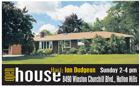
house Host: Ian Dudgeon Sunday 2-4 pm 8490 Winston Churchill Blvd., Halton Hills

Huge Lot - Quiet Crescent! Even little legs can walk to school from this well maintained 3+2 bdrm, 2 kitchens & 2 full bath bungalow with a ton of recent updates! Sun-filled living & dining rms both have new hardwood flooring & crown molding! Updated kitchen offers plenty of counter & cupboard space, with views of the huge yard - great for entertaining! Finished lower level with separate entrance is ideal for in laws with rec room, kitchen, 2 bdrms & 4pc bath! Great location. $459,900.00 Georgetown MLS# W3243490