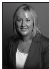
BPHE, R.A.C, R.TCMP

Acupuncture & Traditional Chinese Medicine @ HealthSpan Wellness