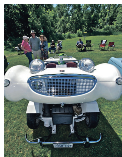
An Austin Healy at last year's Classics Against Cancer Show.