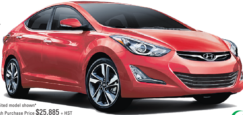
Limited model shown* Cash Purchase Price $25,885 + HST