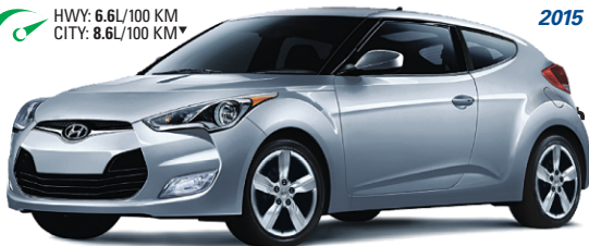
Tech Auto model shown* Cash Purchase Price $23,929 + HST

2015 VELOSTER MANUAL CASH PURCHASE PRICE: $16,995 ‡ INCLUDES $2,832 IN PRICE ADJUSTMENTS §