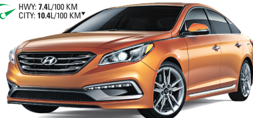
Sport 2.0T model shown* Cash Purchase Price $34,767 + HST