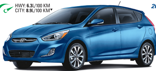
GLS model shown* Cash Purchase Price $19,484 + HST

2015 ACCENT 5-DOOR L CASH PURCHASE PRICE: $10,995 ‡ INCLUDES $4,232 IN PRICE ADJUSTMENTS §