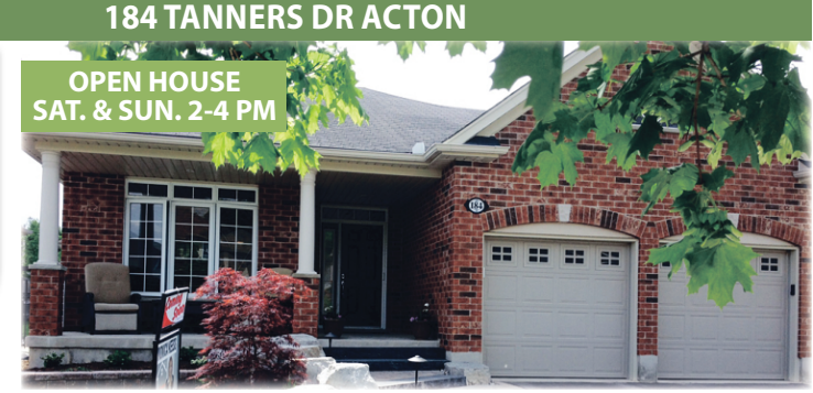
Charleston Built 2 + 2 bedroom bungalow

Absolute turn key condition. 9' ceilings, hardwood flooring, gas fireplace, open concept, main flr laundry, fully finished bst with 2 bd & full bath, beautiful landscaping and more!