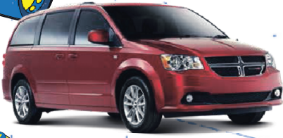
2015 DODGE GRAND CARAVAN CVP