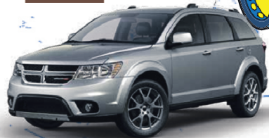
2015 DODGE JOURNEY CVP