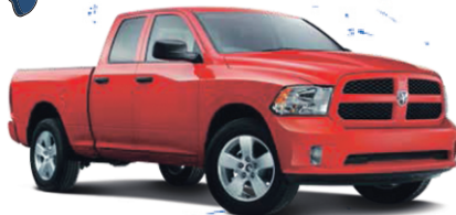
2015 RAM 1500 SXT QUAD CAB $26,995*

HOW LOW CAN WE GO? WE'LL ZAP YOUR CREDIT BLUES WITH LOW NON-PRIME RATES!