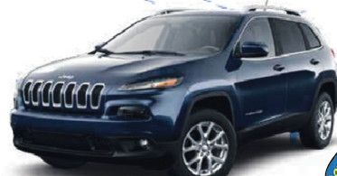
2015 JEEP CHEROKEE