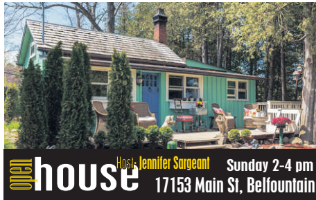
house Host: Jennifer Sargeant Sunday 2-4 pm 17153 Main St, Belfountain

Your Family... Is all that is needed to complete this 3+1 bdrm, 2.5 bath detached 2 storey home located on a premium corner lot in Fletcher's Meadow! Spacious open concept main level with Living & Dining rm combo, family-sized Kitchen with eat-in area & W/O to nicely landscaped yard! Second level Family rm with hardwood, office nook & gas fireplace! Finished lower level - 4th bdrm & separate access through garage! Great location close to GO transit, parks & amenities. $539,000.00 Brampton MLS#W3200037